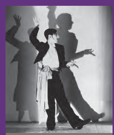
Frederick Ashton in Façade, 1935